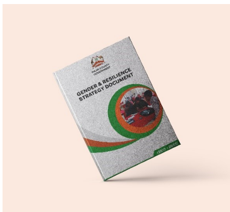
Wajir County Gender and Resilience Strategy, 2017 CIS Document. Click Here

This document was developed with considerable support from BRACED and it lays out a vision “To create a gender responsive, resilient County where human rights are upheld and women, men, boys and girls have equal opportunities to participate in the development process” (WCGS, 2017).