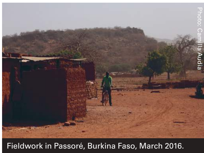
Fieldwork in Passoré, Burkina Faso, March 2016.

By contrast, the Passoré province of Burkina Faso has seen decades of previous NGO intervention. The strong link between the communities and local partners might bias the overall intervention and make it more difficult to trace project outcomes back to BRACED. However, partners are likely to be more embedded in the social fabric and have a more profound influence in the longer term. Similarly, the quantity of pre-existing agricultural and livelihood-related data offers a great comparison tool to measure change and to grasp resilience. This contrast in contexts is an important variable to keep in mind when analysing changes in the AAT components of resilience.